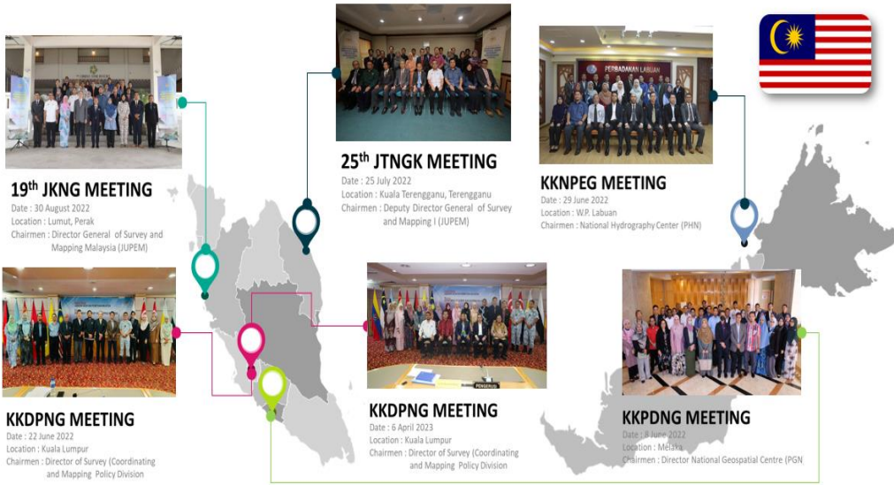
National Committee / Working Group Meeting